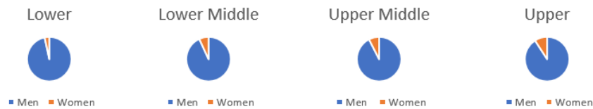
Number of men and women in each pay quartile