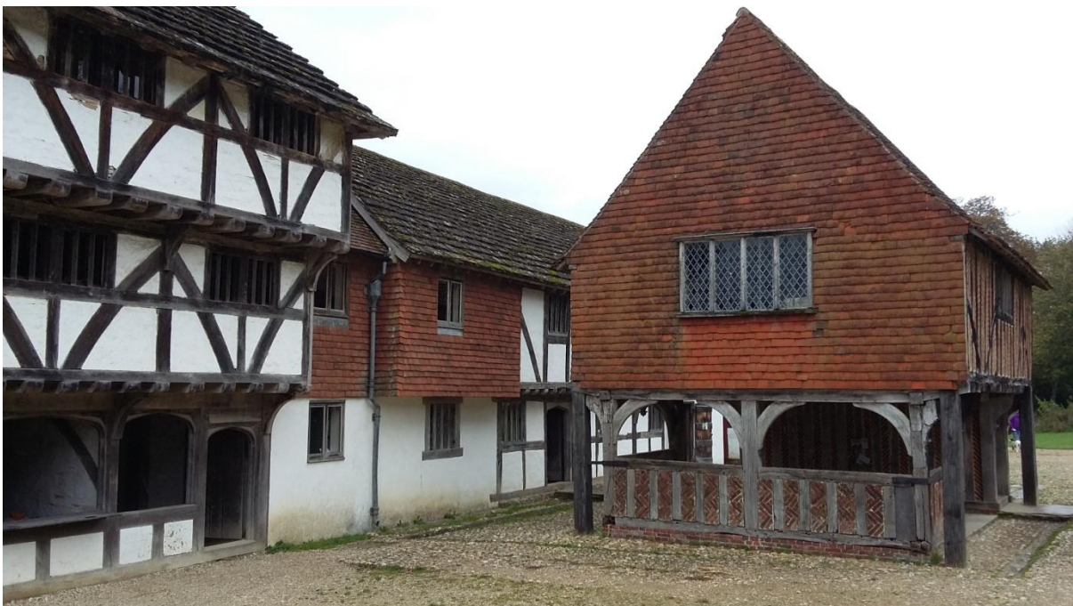
Part of the Weald and Downland Museum