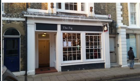
The Fig Cafe