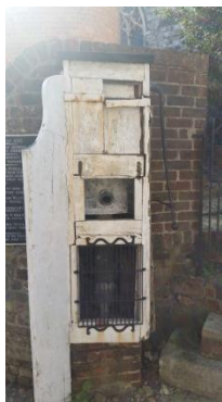
Old Pump housing

Whilst over the last year attention has been quite rightly focused on the issue of the Landgate, residents and interested passers-by will have noticed that the seemingly never-ending saga of the Church Square (Pump Street) pump has finally reached a conclusion. It was restored at the end of last summer and we hope that members will agree that it is a vast improvement on its previous sorry state. All that remains is for an appropriate plaque to be designed and displayed alongside.