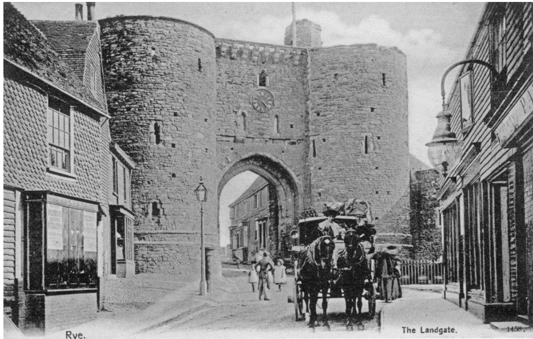
The Landgate in early times (compare with front cover)