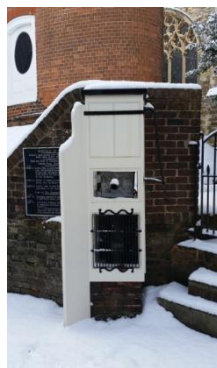
New pump housing

As ever, we continue to monitor the appearance of the town and its environs. The High Street, Strand and surrounding areas have caused us some concern this year for a variety of reasons: inappropriate colour schemes and use of materials, decaying woodwork, obtrusive ventilation systems and incomplete renovations, to mention just a few.