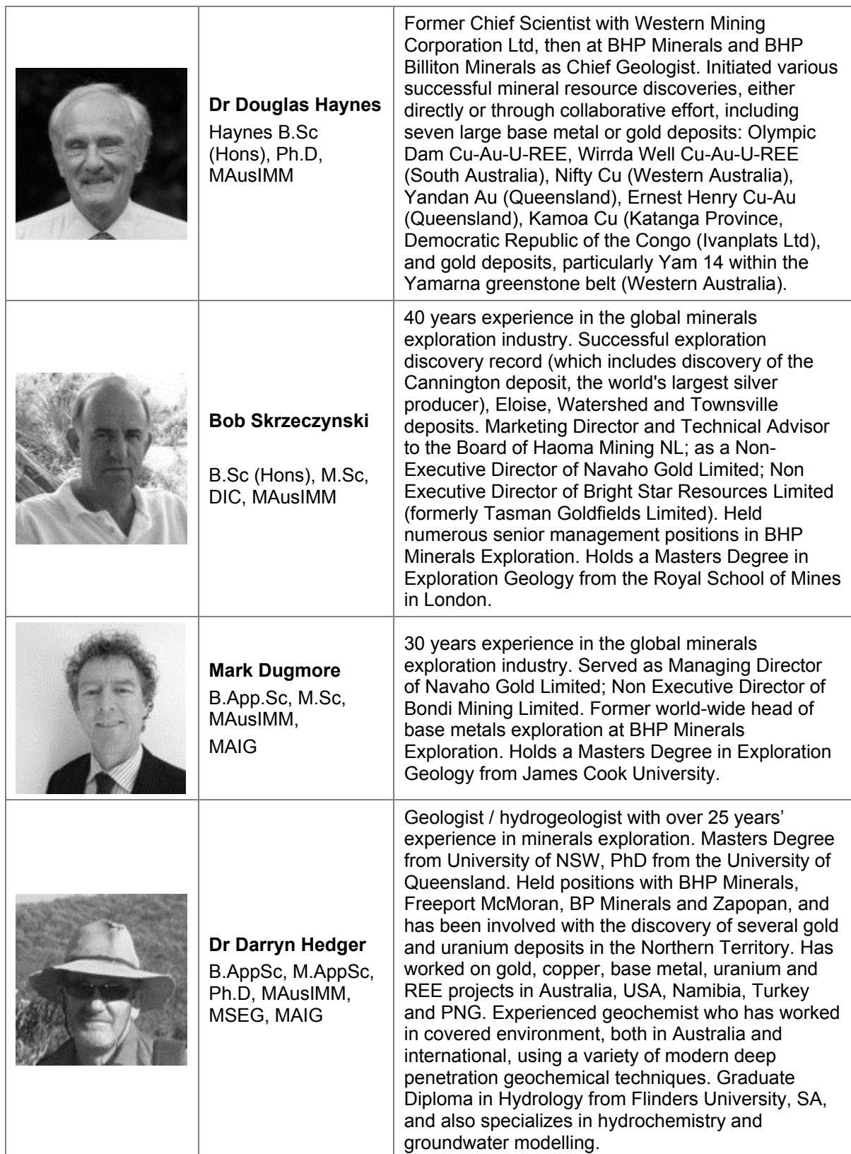
Table A2: LCME’s Australian advisory team biographies