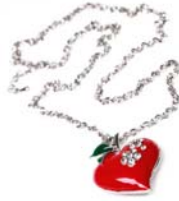
Cadmium in Children's Jewelry

As laws and regulations tighten for the safety of our children, companies will look towards laboratory such as ours to test their product to ensure compliance.