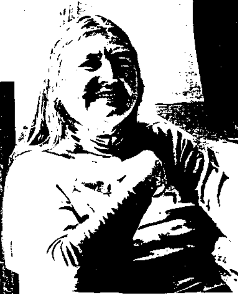
Gertrude Prokosch Kurath August 19, 1903-August 1, 1992