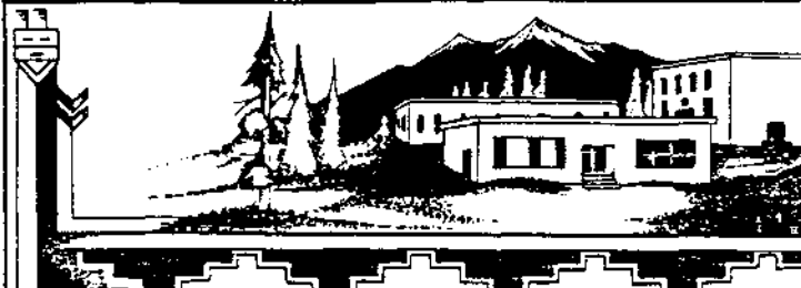
KINLANÍ BORDERTOWN DORMITORY. P.O. BOX 609. FLAGSTAFF, ARIZONA 86002 (602) 774-

The second way you can help is to check out for cruising angels. If you find one please send that angel to CCDR.