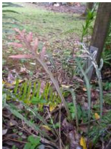
Pink new growth