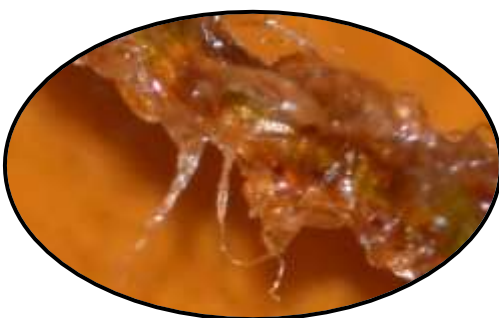
Rhizome scale with entire margin and tapering to a hair-like apex