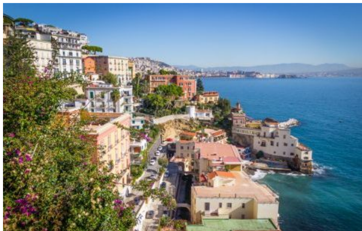
Posillipo, Naples, where Lila and Stefano celebrated their wedding.