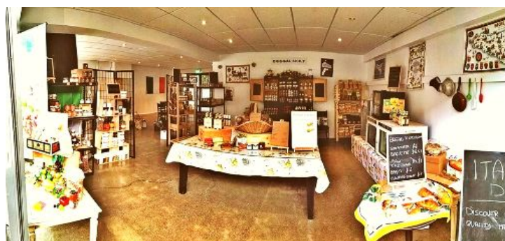
The new store in 210 Victoria Street West, Auckland CBD

Original Sicily is an importer, distributor and retailer of fine foods from Italy. If you love Sicilian food, here you will find a wide range of products typical of the Sicilian culinary tradition: sweet spreads, chocolates, pastries, cannoli, jams, pestos and pasta sauces, pistachios and other nuts, and more (see our recipe on page 9). Each product is the result of traditional recipes and has a very definite geographical and cultural origin, which makes them all special and unique.