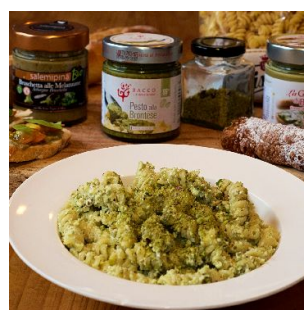
Pasta con Pesto alla Brontese.

The company was born with the idea of sharing the Italian food culture and passion with New Zealand, to provide New Zealanders with the opportunity to explore new and exciting flavours and to create, with little effort, tasty recipes by using high quality products.