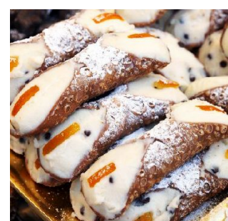
Who can resist exquisite cannoli di ricotta?