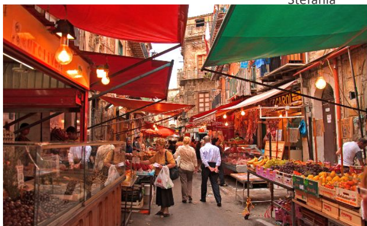
Mercato di Ballarò is one of the oldest street markets in Palermo, Sicily.