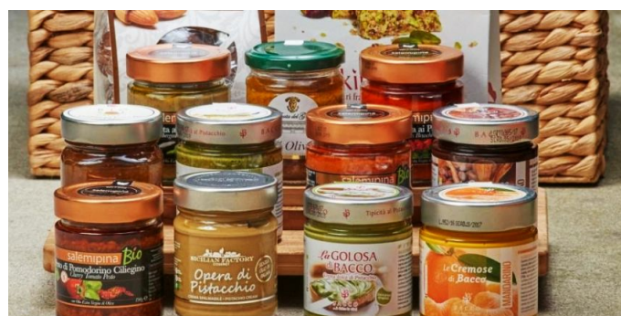
Original Sicily stocks a wide variety of regional dips, spreads and sauces for you to try at home.

Discover here the full range of delicious products