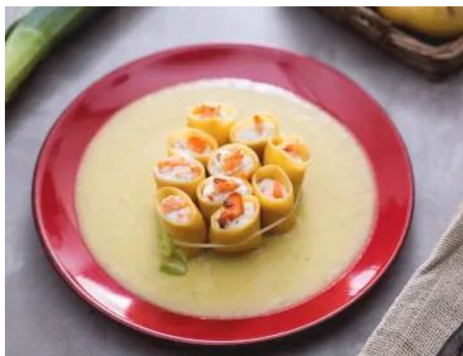
Paccheri filled with ricotta and salmon in a leek-potato soup