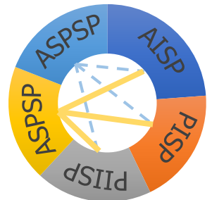
Without standardised API: implementation for each ASPSP

When more than 4,000 banks in Europe would each have their own standard, this would create a Pan-European IT complexity with high related costs for all and block innovation. For these reasons, standardisation is considered key to successful PSD2 XS2A.