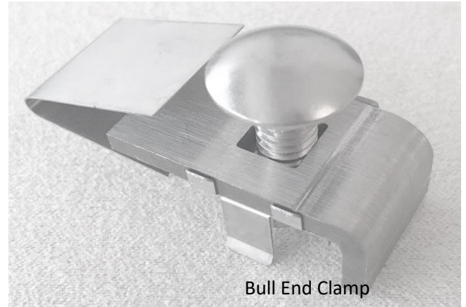
Bull End Clamp