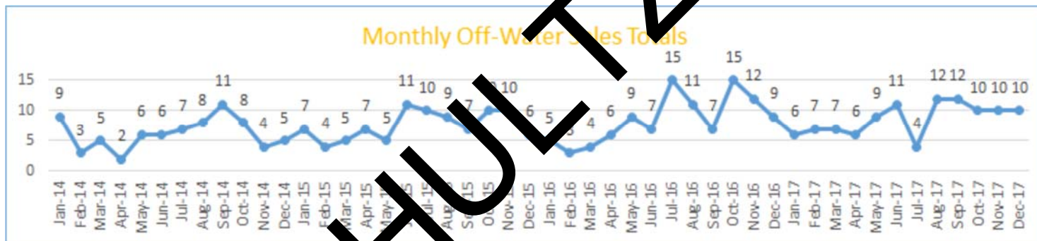
Figure 7: Off-Water Home Sales Totals by Month.