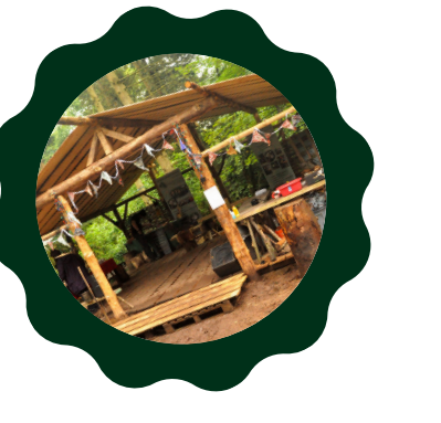
in pictures & numbers!*