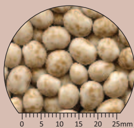
PBA Jurien ®

Protein and alkaloid: % as received, whole seed, 6 sites, 2010–2014