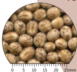
PBA Barlock ®