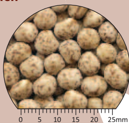
PBA Gunyidi ®