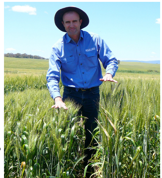
LRPB Mustang (LHS) vs Suntop (RHS) Junee NSW 2016