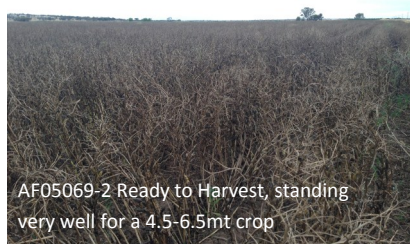
AF05069-2 Ready to Harvest, standing very well for a 4.5-6.5mt crop