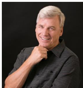
Pete Early Best Selling Author & Mental Health Advocate