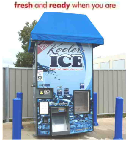
Locations: FORBES ROAD & STAR HOTEL

☎ — 6862 4111 227 CLARINDA STREET, PARKES 2870