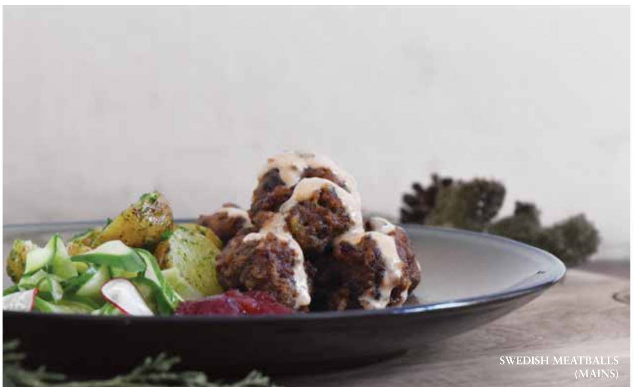
SWEDISH MEATBALLS (MAINS)