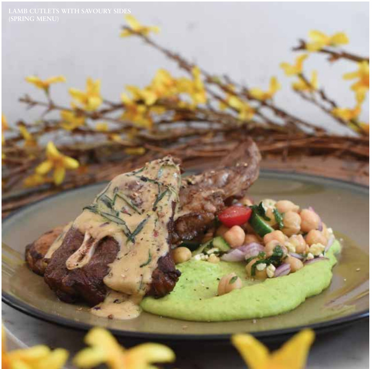
LAMB CUTLETS WITH SAVOURY SIDES (SPRING MENU)