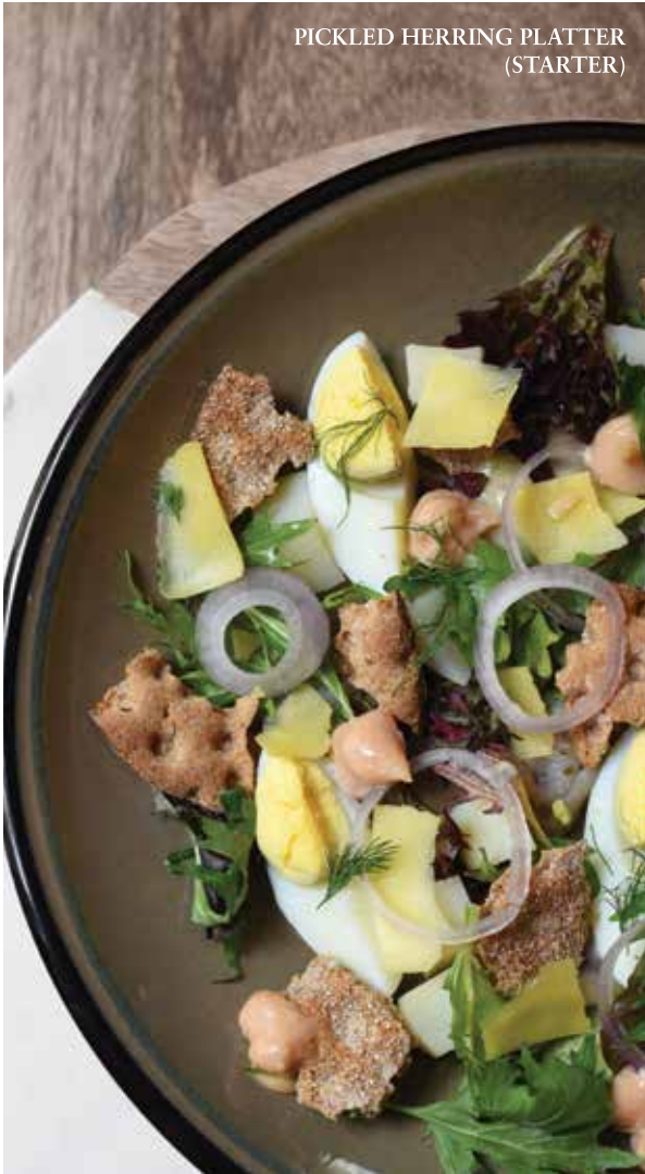
PICKLED HERRING PLATTER (STARTER)