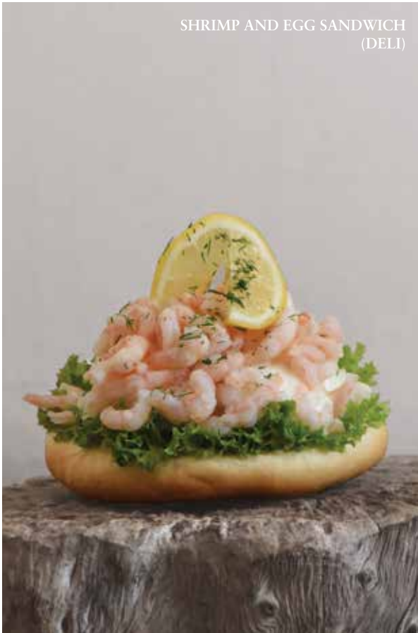
SHRIMP AND EGG SANDWICH (DELI)