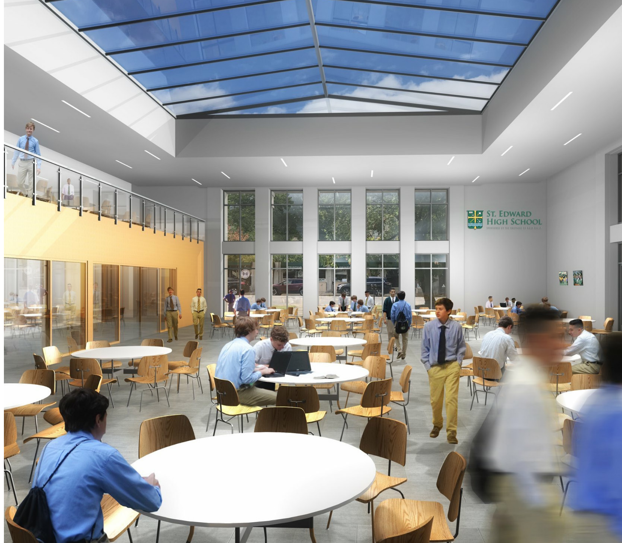
A conceptual rendering of the Marilyn and David Palisin '64 Commons – the new student life and dining space that will be built to the front of campus as part of The Courage to Act Campaign.