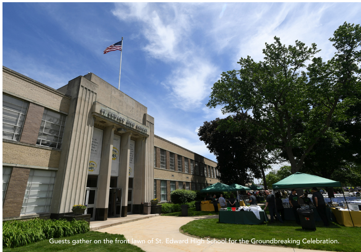
Guests gather on the front lawn of St. Edward High School for the Groundbreaking Celebration.

The Palisin Commons is part of a larger fundraising initiative that kicked off in September 2016 when St. Edward High School launched The Courage to Act Campaign, a $22 million initiative, the most ambitious fundraising cam-