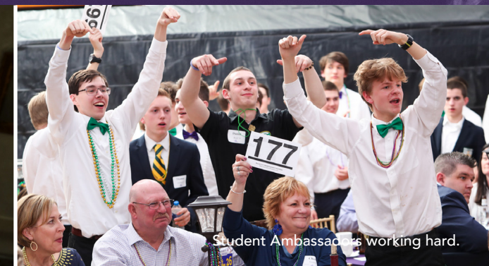
Student Ambassadors working hard.