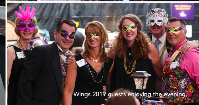
Wings 2019 guests enjoying the evening.