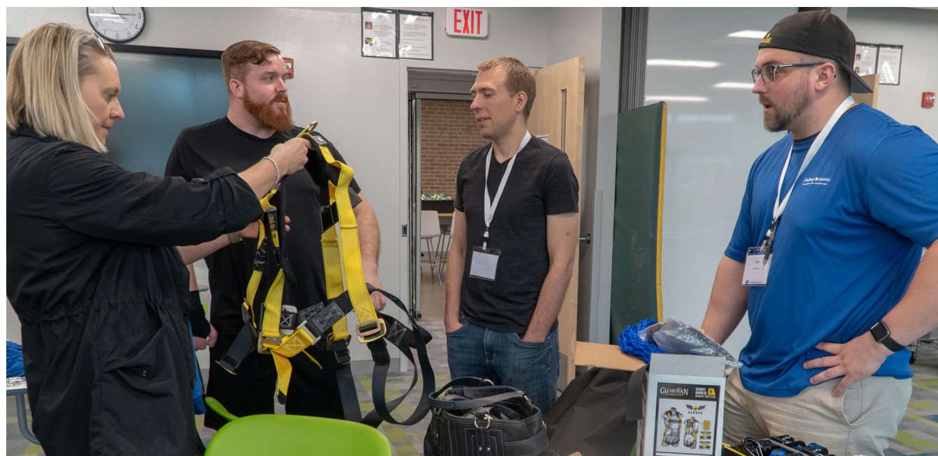
CAMVETS engineers, designers and volunteers utilize the Ideation Space, Engineering Manufacturing Labs and Makers Deck at St. Edward High School to brainstorm ideas, test out designs and build their devices.