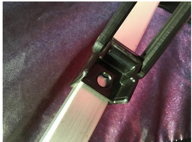
Figure 7.5.1 Disengage Truss System (Left Side)

7.5.2. Depress the snap button inside the truss slider on the opposite side and pull the center hinge inward to disengage the truss slider. The snap button should be at least one inch past the slider after this step.