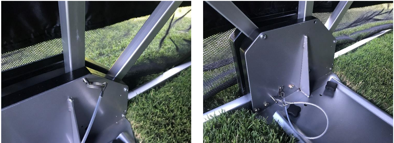
Figure 6.1 Remove Hub Pins