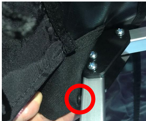
Figure 5.4 Snap the Corners