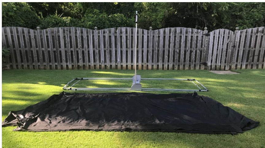
Figure 5.1 Unfold the Cover

5.2. Place the center of the cover on the frame so the center aligns with the peak.