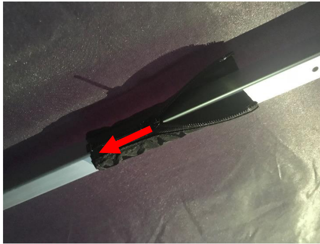
Figure 7.8 Unzip the Peak Sleeves

7.8. Unzip the sleeves found on both sides of the peak.