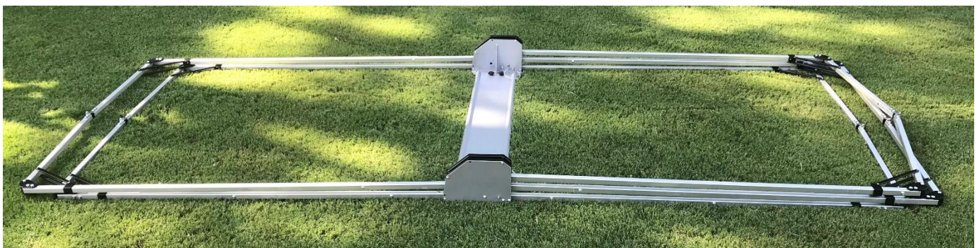
Figure 3.6 Install the Crossmember