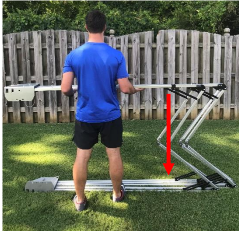
Figure 7.13 Folding the Frame