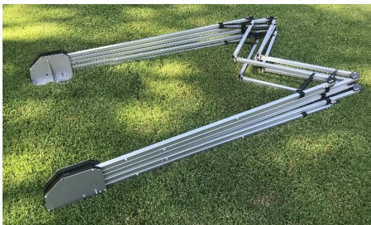
Figure 7.12 Modified Ready Position

7.12. Return SidelineER to a modified ready position.