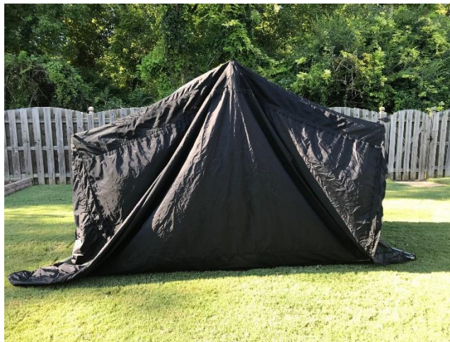
Figure 7.6 Telescope Diagonal Tubes

7.6. Telescope the diagonal tubes down to their travel position.