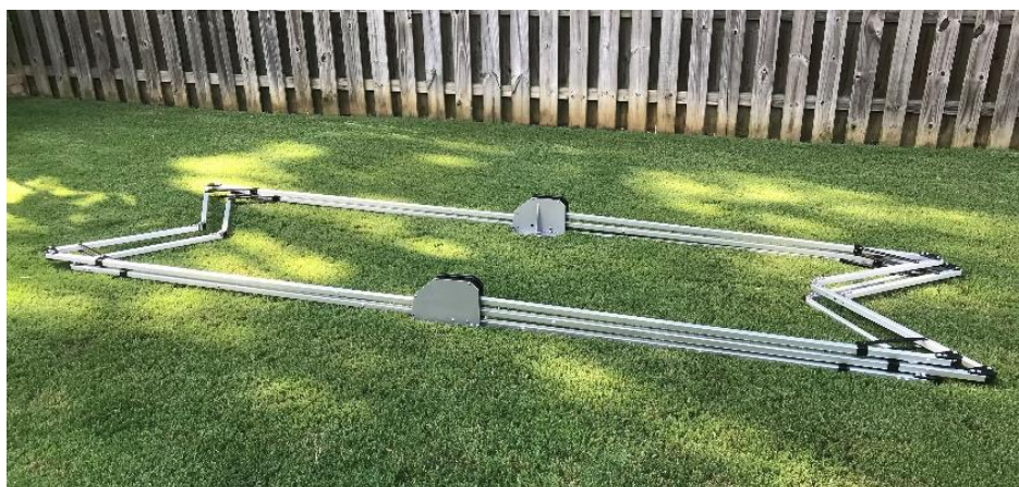
Figure 7.11 Cover Removed

7.11. Remove the cover. The frame will now be in a flat position with the cross supports partially angled to the inside.