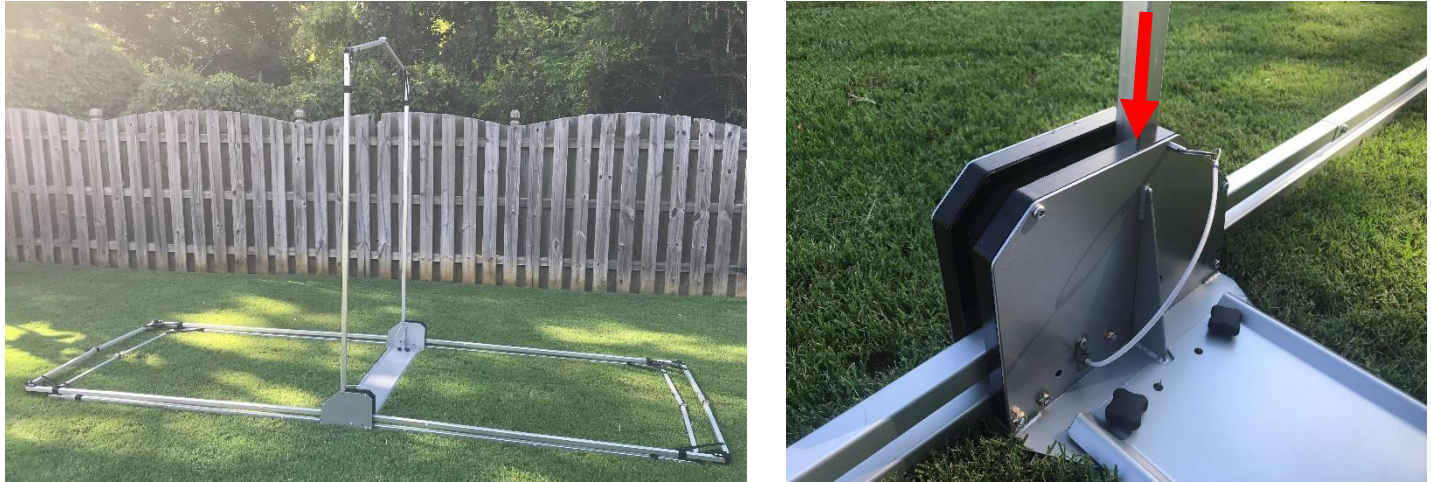
Figure 3.7 Raise the Center Support