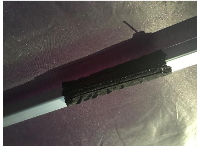
Figure 5.3 Attach the Cover