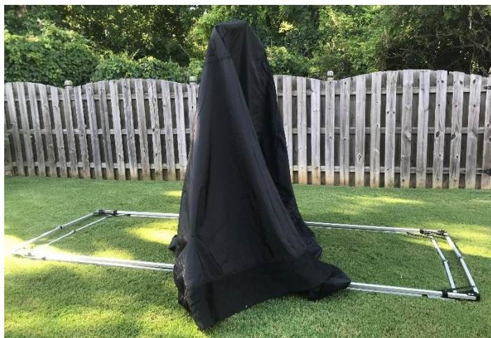
Figure 5.2 Place the Cover on the Frame

5.2. Place the center of the cover on the frame so the center aligns with the peak.