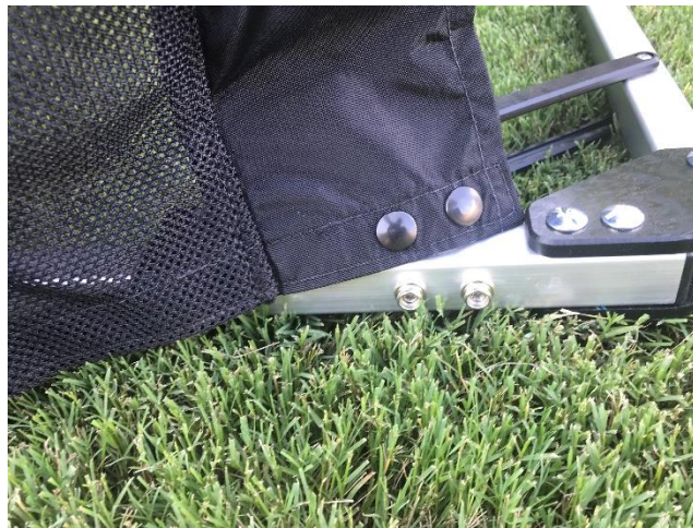
Figure 5.7 Snap the Bottom

5.7. Attach the cover to the lower frame supports. There are four lower snaps per tube (16 total).