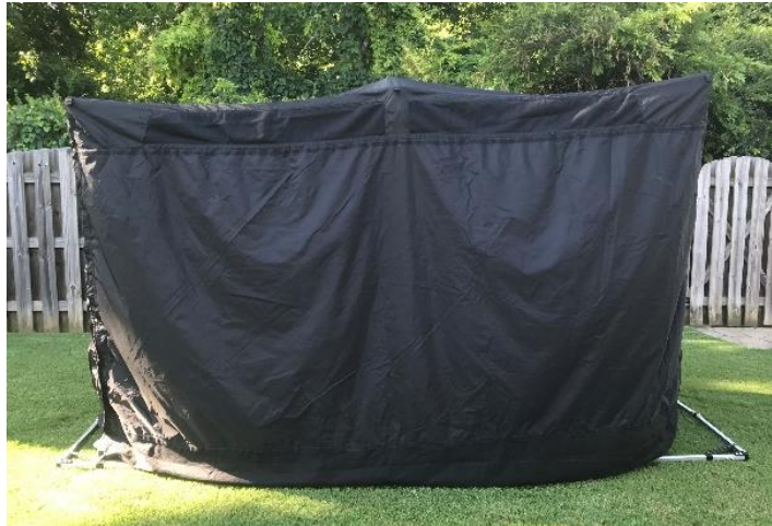
Figure 5.6 Extend the Diagonal Supports

5.6. Extend the diagonal supports into their locked position.