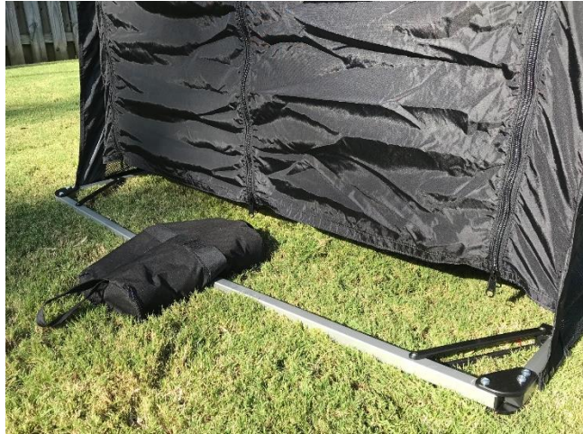
Figure 6.3 Sandbag