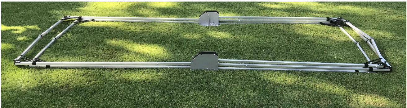
Figure 3.5 Lock the Truss System