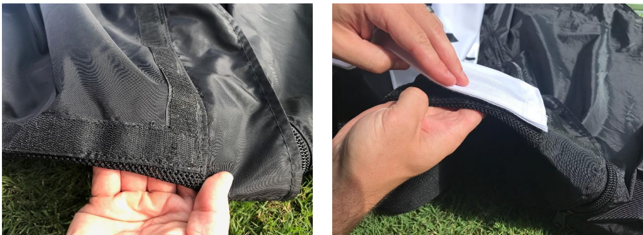
Figure 4.5 Attach the Branding