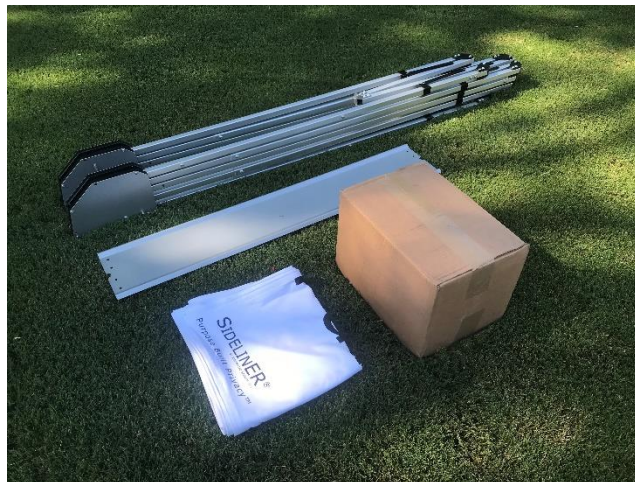
Figure 2 Required Components