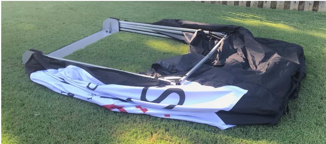
Figure 6.2 SidelinER Ready Position