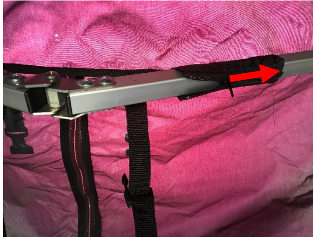
Figure 7.7 Unzip the Door Sleeves

7.8. Unzip the sleeves found on both sides of the peak.