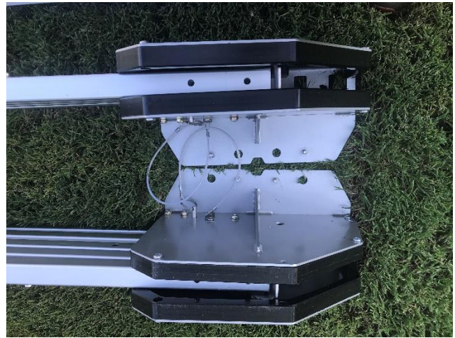
Figure 3.2 Separate the Hubs