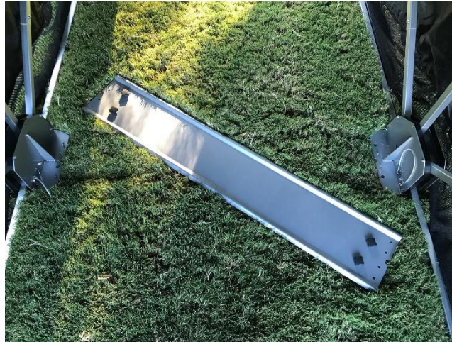
Figure 7.4 Remove the Crossmember

7.5. Unlock the truss system (10 total) on each support. Alternate left and right sides of the same support before moving to the next support.