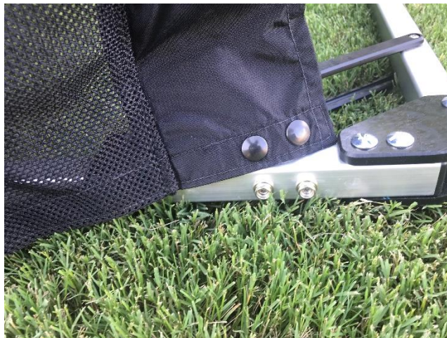
Figure 7.10 Horizontal Tube Snaps

7.11. Remove the cover. The frame will now be in a flat position with the cross supports partially angled to the inside.