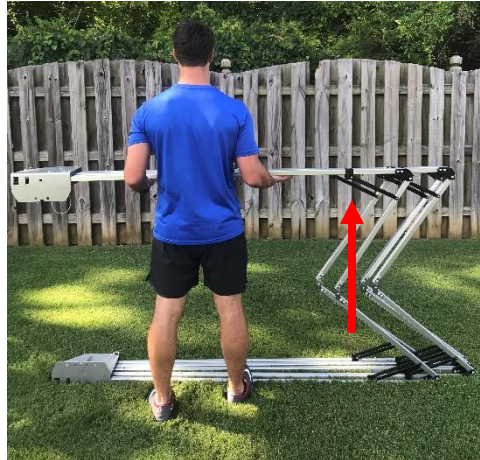
Figure 3.3 Separate the Sides