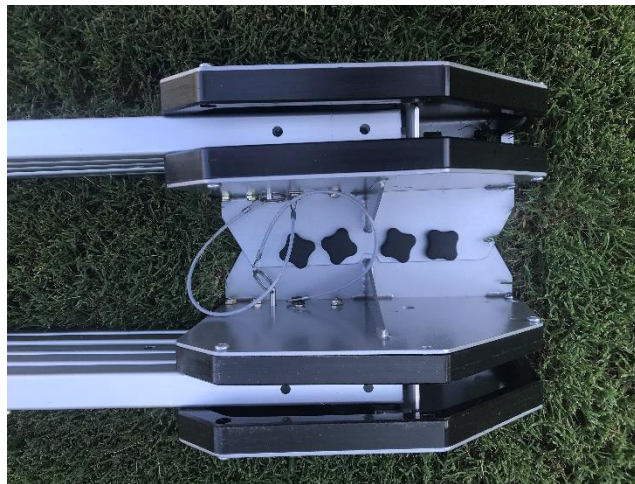
Figure 7.14 Knob Installation