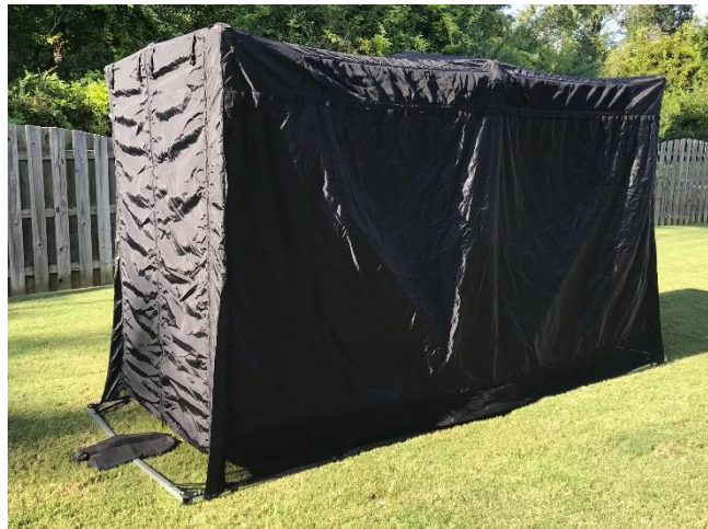
Figure 7.2 Fully Expanded