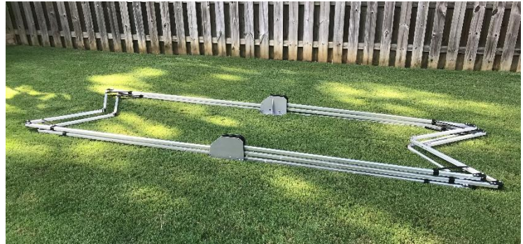
Figure 3.4 Lay Out the Frame