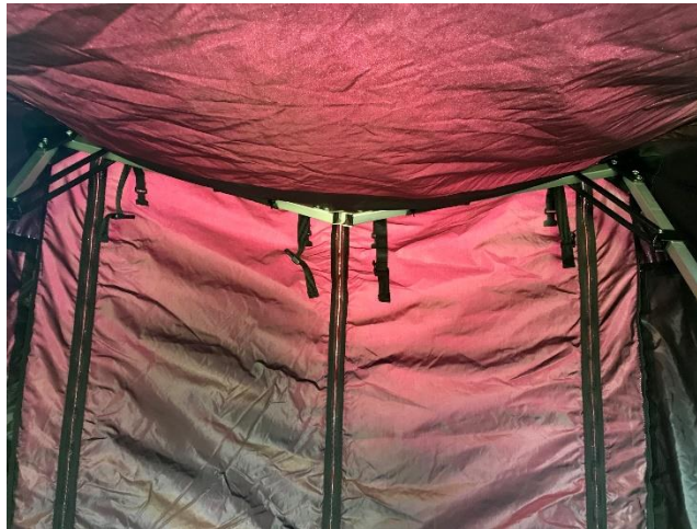
Figure 7.5.2 Disengage the Truss System (Right Side)

7.6. Telescope the diagonal tubes down to their travel position.