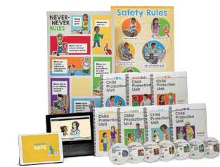
Child Protection Unit