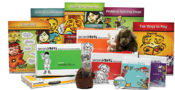
Second Step Program