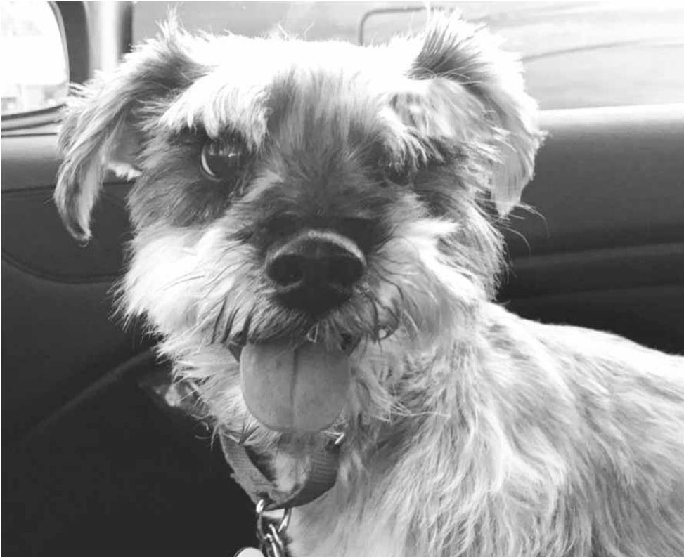
Enjoy you new family Emmy Lou!

Congratulations to little Emmy Lou and her new mom. Emmy Lou is the senior female rescue that came to us weighing a mere 11 pounds and looking pretty scrawny. She has gained 3.5 pounds and currently looks great. Emmy Lou had a dental and a full senior screen that revealed no medical problems. In fact, the only issue was a little incontinence problem, which may require diapers down the road. She now lives in Huntington Beach with her retired mom who has no problem with diapers and dogs if it should come to that. In fact Emmy Lou's mom has had many Schnauzers in the past, including an eight-year-old that she adopted who lived another 10 happy years before going to Rainbow Bridge. When she met Emmy Lou, she was absolutely thrilled with how sweet and adorable she is and there was never a question of her