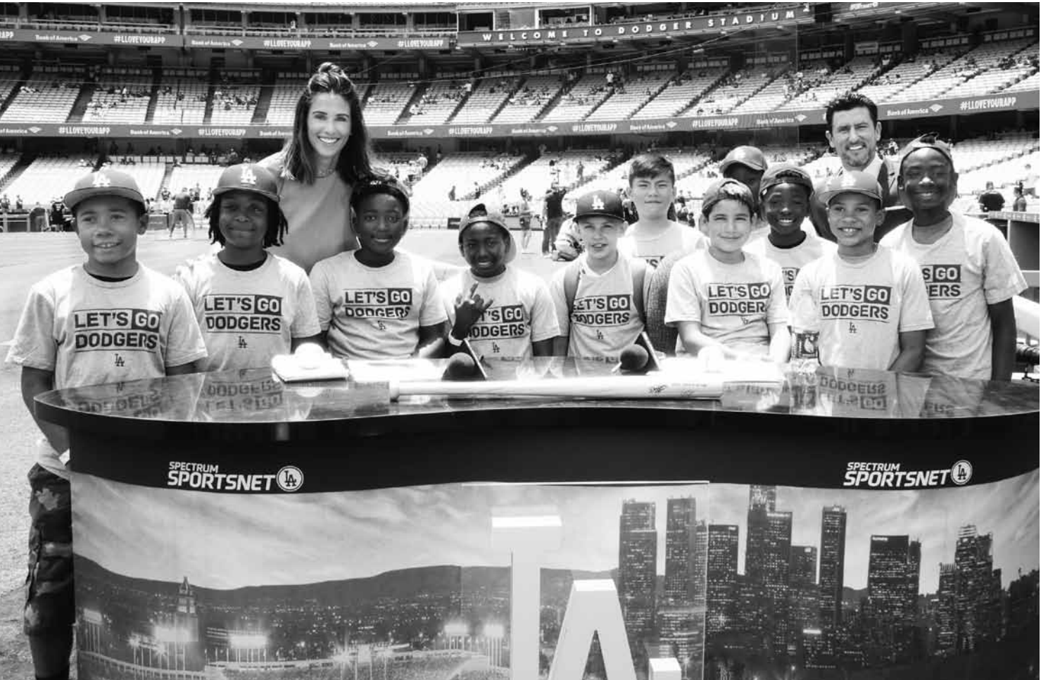
Spectrum SportsNet LA (SNLA) recently hosted student-athletes from the Business of Success Beyond Sports (BOSS) organization, an integrated academic leadership program for middle school and high school boys from under-sourced Los Angeles communities, at a Dodgers game for an exclusive experience with the SportsNet LA broadcast team. Attendees were treated to a tour of the SNLA TV booth, led by SNLA analyst Orel Hershiser, before heading to the field to watch the SNLA Dodgers pregame show live and to meet host Kelli Tennant and studio analyst Nomar Garciaparra (as shown in the photo).