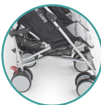
Large storage Basket