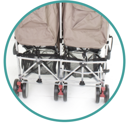
Easy to Fold