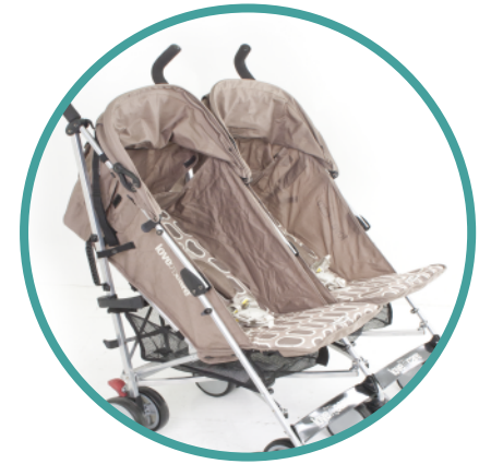
Adjustable Hood and leg rest