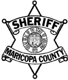
Joseph M. Arpaio, Sheriff