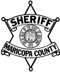
Joseph M. Arpaio, Sheriff