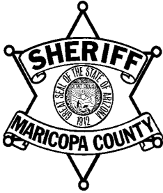
Joseph M. Arpaio, Sheriff