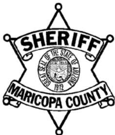
Joseph M. Arpaio, Sheriff