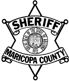
Joseph M. Arpaio, Sheriff