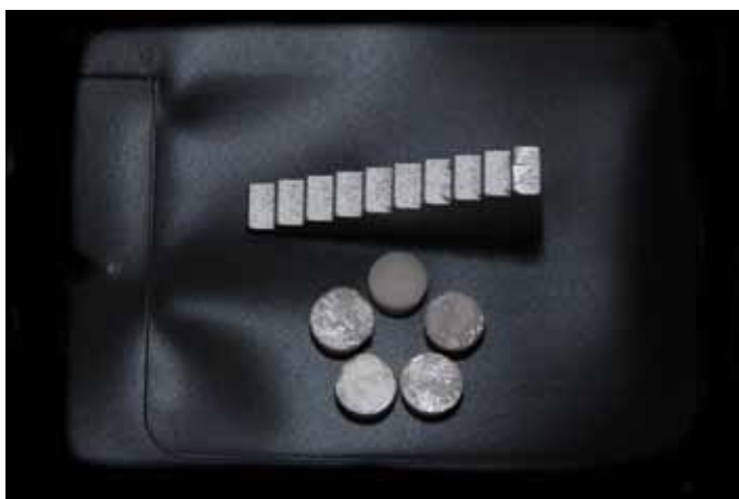
1 Specimen disks with modified step wedge.