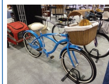
Bike with your Pet