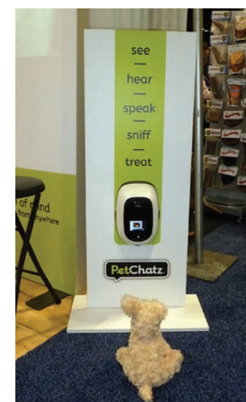
Talk to your Pet while you're away!