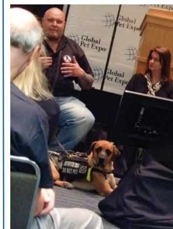
K9 for Warriors