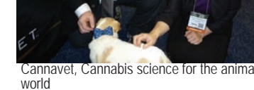
Cannavet, Cannabis science for the animal world