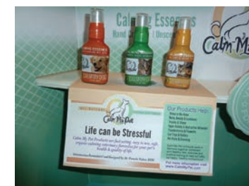
Calming essences for your pet