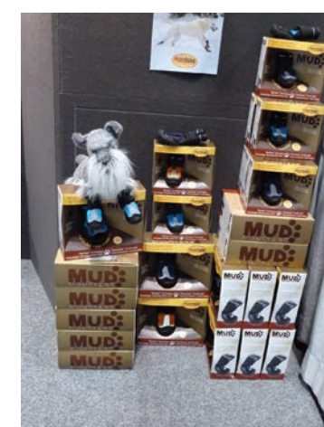
Run with your Pet