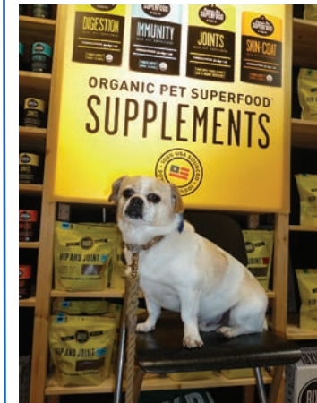
BIXBI SUPERFOOD for your pet!