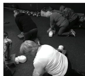
Family and CPR Training