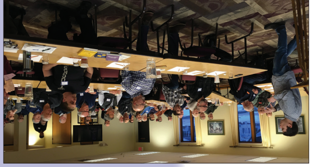
Men's Morning of Reflection