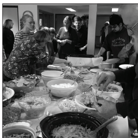
Tacos and Tenebrae