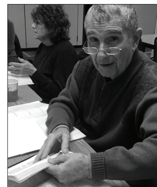
Gospel of John Bible Study