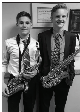
Middle School Musicians