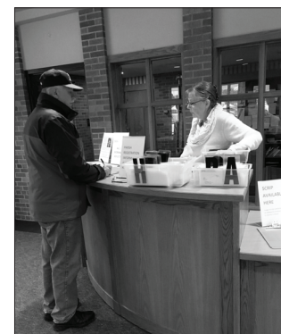
New Information Desk