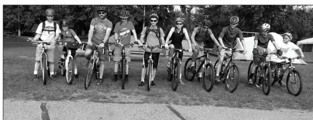
Boy Scout Event