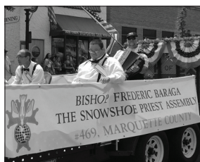
Independence Day Parade