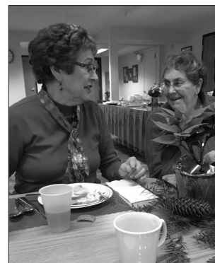
Altar Society Christmas Lunch