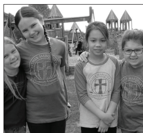
Father Marquette Catholic Academy Students

The 2018 St. Michael the Archangel softball team had a regular season record of 4-4. The team made it to the third round of the playoffs and a postseason record of 1-2. The group finished fifth out of nine teams.