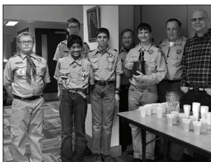
Boy Scouts With Men's Club