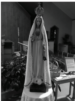
Lady of Fatima Statue