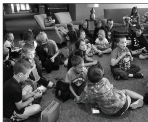
Totus Tuus Summer Program