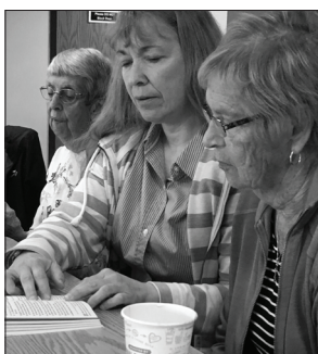
Tuesday Bible Study