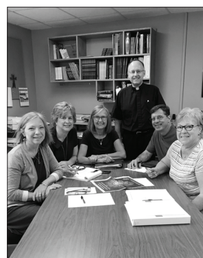
Amazing Parish Team