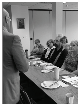
Stewardship and Estate Planning Workshop