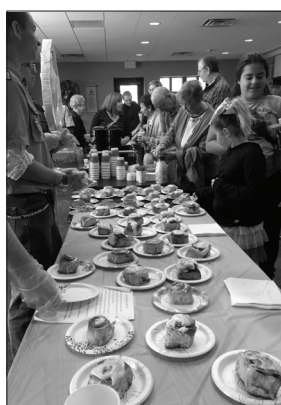
Cinnamon Roll Sunday