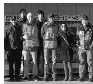
Campus Ministry helps Knights of Columbus in Tootsie Roll Drive