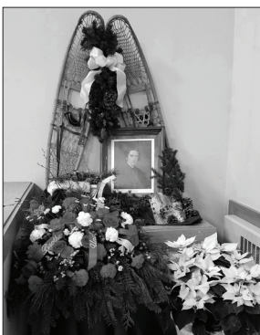
Bishop Baraga Display

and late evening use of the basketball court on the school playground, particularly during the summer months. The agreed upon solution was off-site summer storage of the backboards and nets. A picnic table was also added to the playground during the school year. Volunteers also undertook beautification of the south entrance to the church building, repairing landscaping and painting doors, windows and other trim.