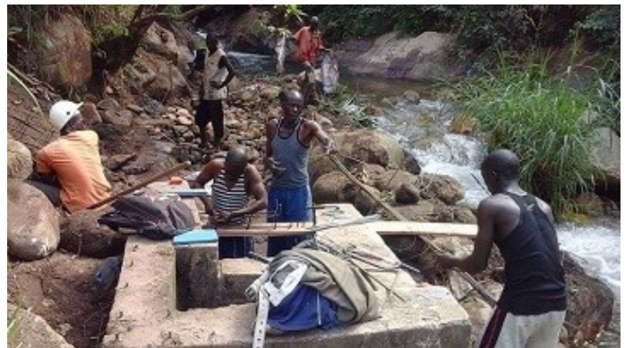
Praise God, the water is flowing again at Congo for Christ!