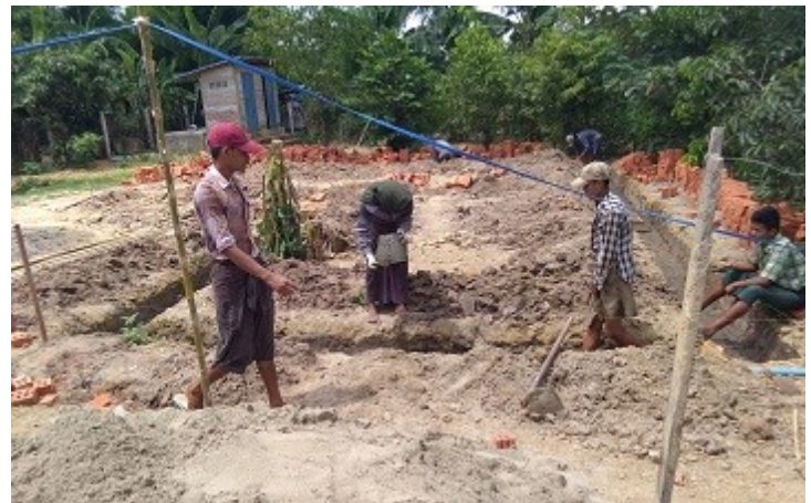
The foundation for new building is dug by hand.

The total cost of the new building is estimated to be $8,810. Some of you have already donated to this need through the donation page on our website. We have been able to send your funds to keep the construction moving along. Thank you to all who have given and any additional donations for this project can be designated for House of Refuge building.