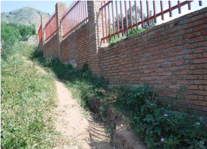
We are so thankful the security wall at CCC is finished!

We are thrilled to report that the security wall at Congo for Christ and Mango Tree School has been fully funded! This has been a project that has taken over two and one half years to complete. The final construction should be finished this week at a total cost of $87,842. Praise be to God for making this possible and a tremendous thank you to everyone who has partnered with us. We cannot overstate the importance of this sturdy brick wall topped with iron bars to keep the children safe. Not only does it provide protection for them, it provides a sense of security and well being in a land with a history of violence and war. All of the children have been impacted by violence and for many it is the reason they are orphans. What a blessing to provide this huge improvement to Congo for Christ.