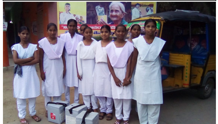
Girls in nurses aid vocational training administered polio vaccine to hundreds of children in bus and train stations.