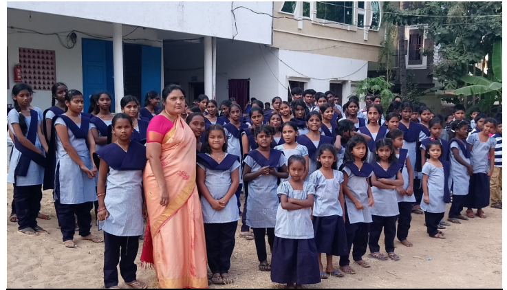
Orphans and teens all received new uniforms for Christmas