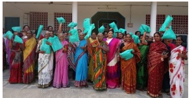
Widows were given new sarees for Christmas