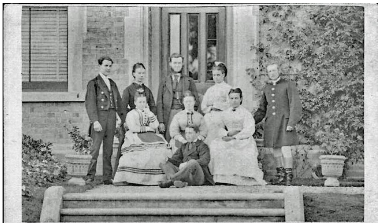
Some of the domestic staff at Rossway