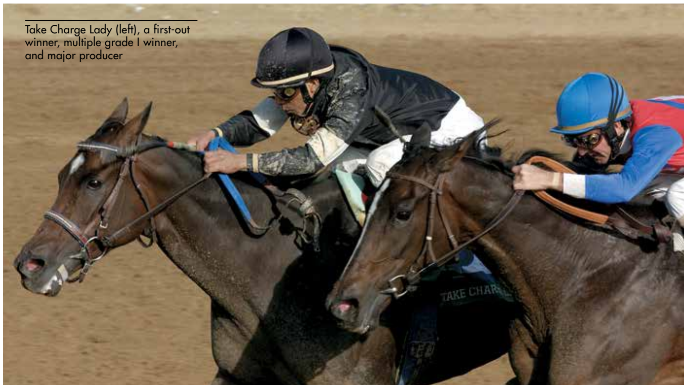
Take Charge Lady (left), a first-out winner, multiple grade I winner, and major producer

Information and Analysis for the Thoroughbred Investor