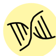
GENETIC INBREEDING SCORE