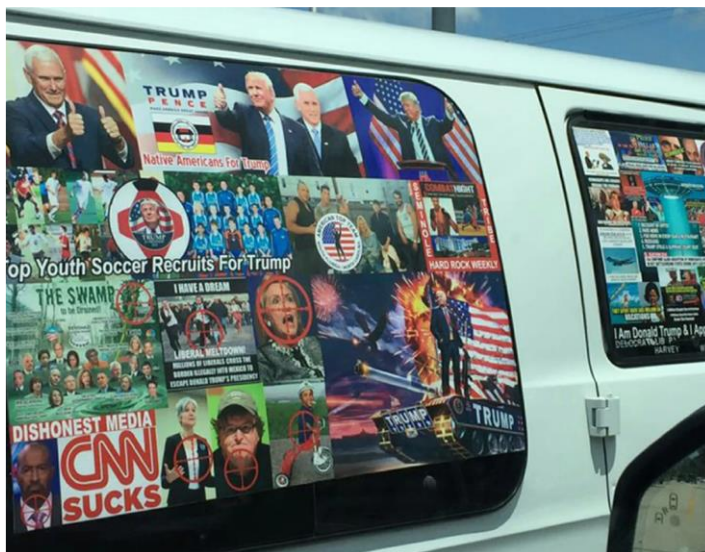
Cesar Sayoc's Van (according to media.)