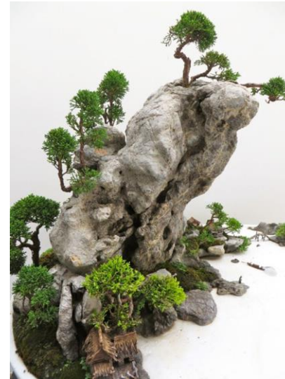
Rock Planting Bonsai