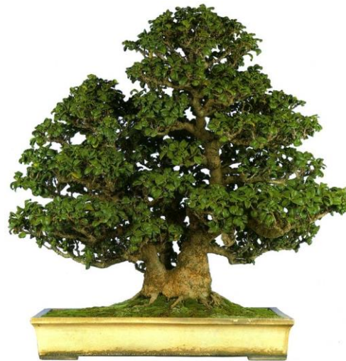
Twin Trunk Bonsai