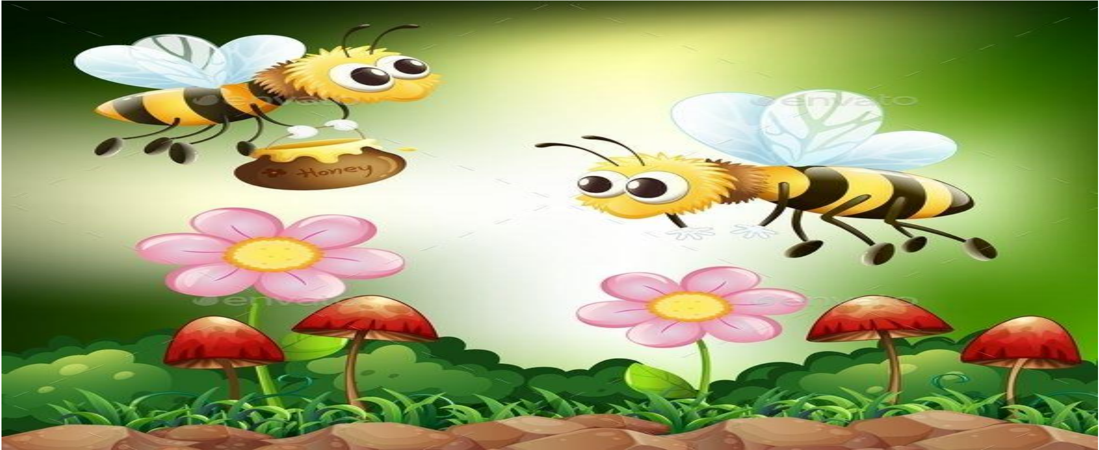
Figure 9. Cartoon depiction of mutualistic symbiosis of bees with flowers and fungi in nature 1

Inquiry Question: If bees were eradicated, how would it affect microorganisms, plants, animals, and humans?