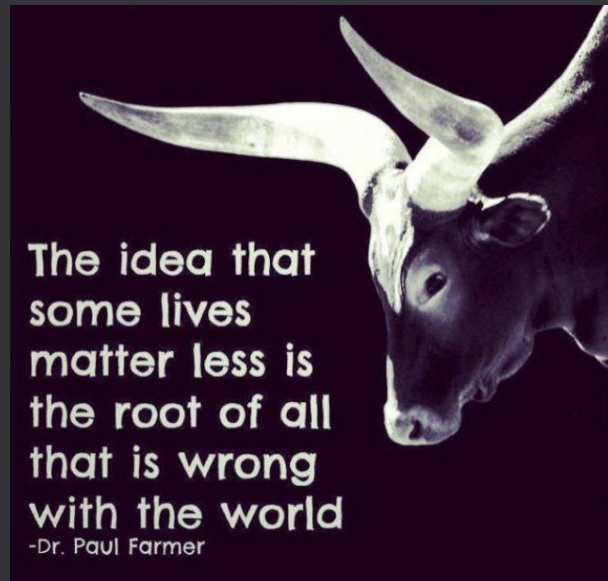
Figure 1. Quote from Paul Farmer A