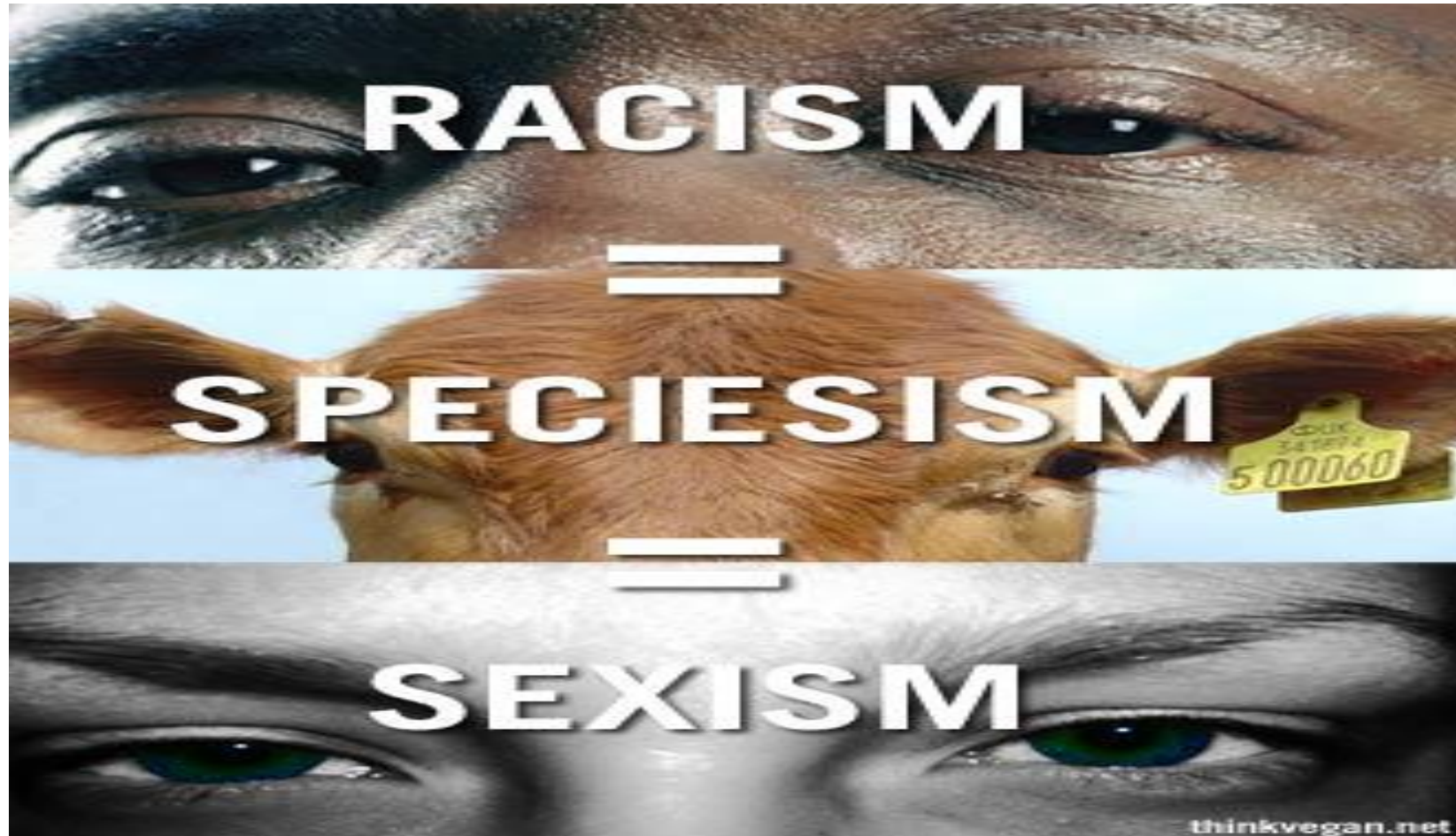
Figure 7. Demystifying the trichotomy between racism, speciesism, and sexism G

Inquiry Question: From a fundamental level, does prejudice and discrimination exist between racism, species, and sexism?