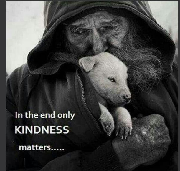
Figure 3. Quote from an unknown author C