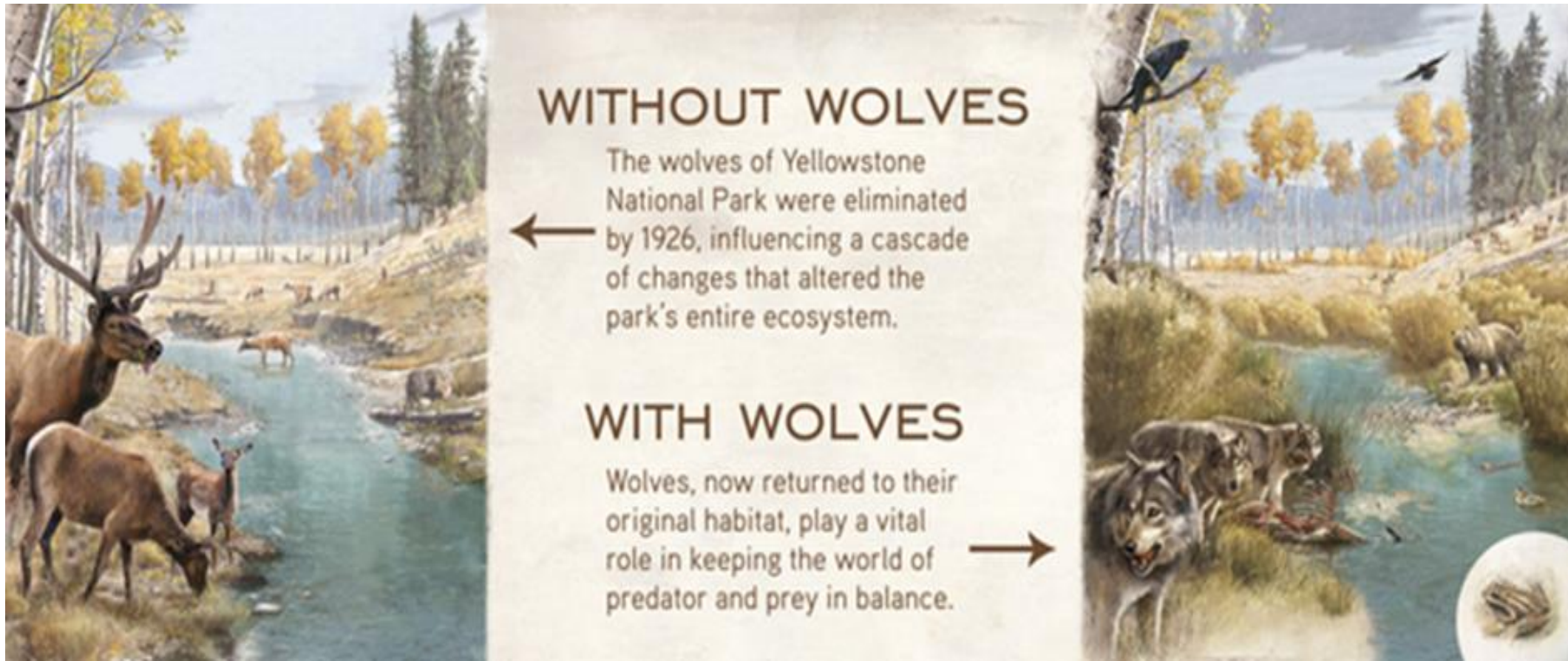
Figure 6. The observable spatial and temporal effects of predatory apex interactions in Yellowstone National Park F

Inquiry Question: How do wolves contribute, regulate, and interact with their environment?