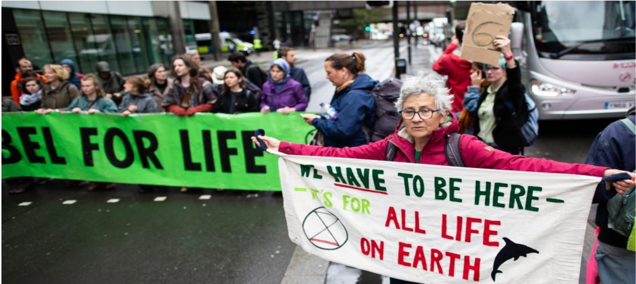
Figure 10. A picture of an environmental protest for all lives J

Inquiry Question: If you were given two options, which one would you desire: a million dollars or equality for all welfare of life on Earth?