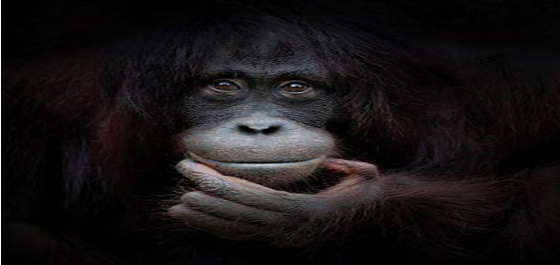
Figure 5. A high contrast photography of an orangutan posing in a thinking stance E

Inquiry Question: What is this orangutan thinking about?