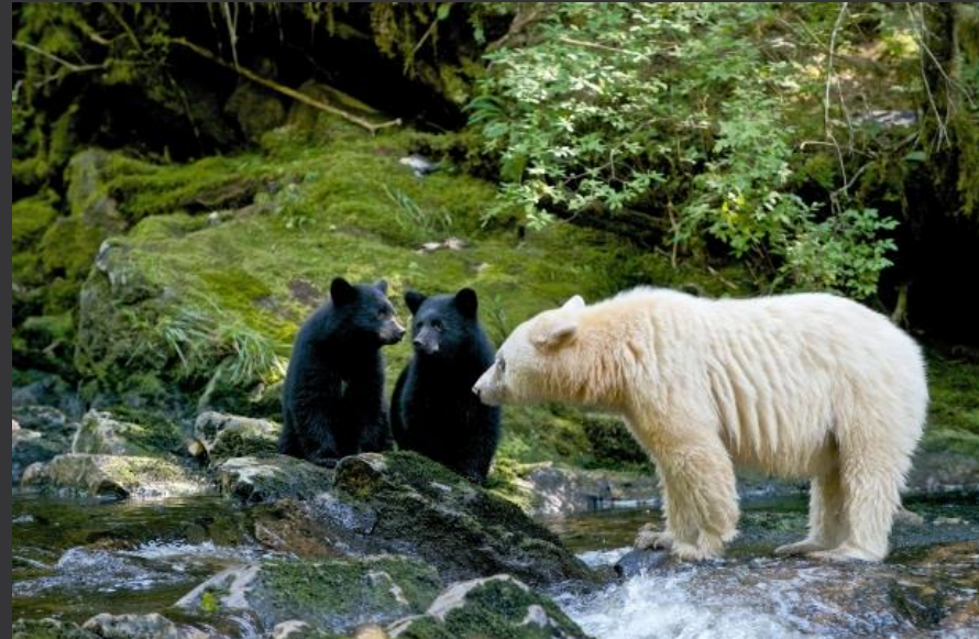
Figure 2. Two black bear cubs and an albino (spirit) bear B