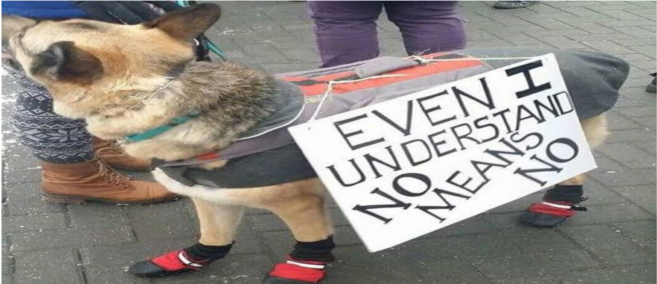
Figure 12. A German Shepard equipped with a protest sign to signify the oppression of ethical consent L

Inquiry Question: What does the word, no , mean to you?