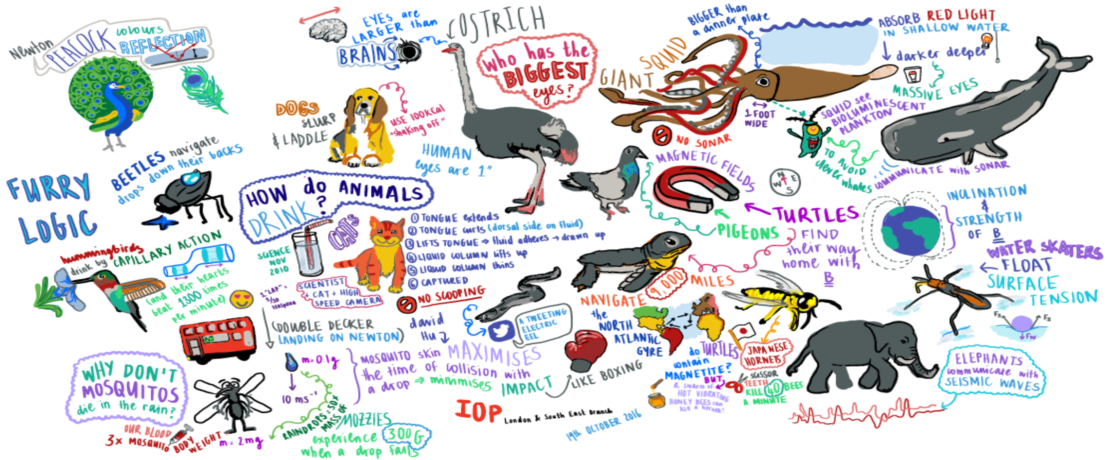
Figure 4. Curiosity and inquiry depiction of aquatic and terrestrial fauna D

Inquiry Question: There are over 1.3 million idiosyncratic species of animals on Earth; how can we compressively learn more about their epistemological phenomena?