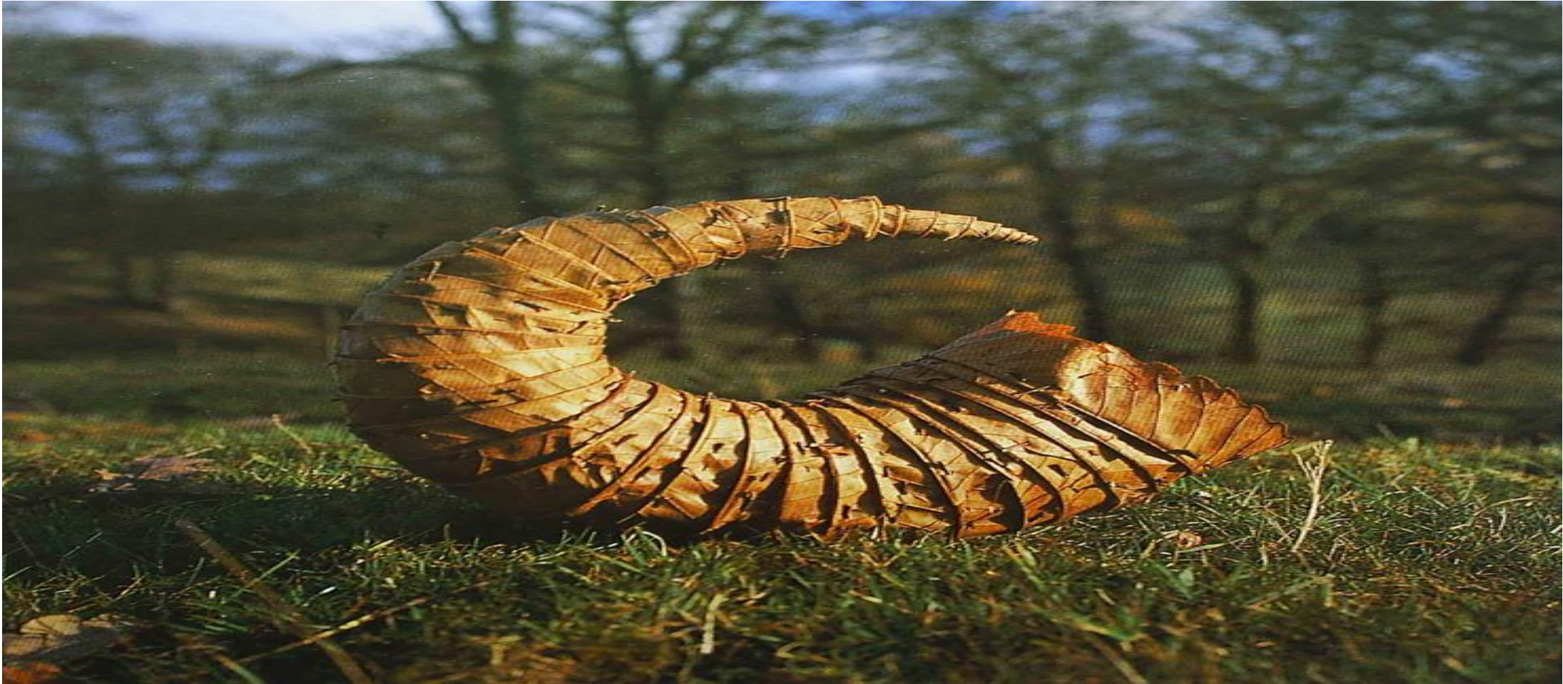
Figure 11. A recreation of an animal horn made from plant-based materials from Andy Goldsworthy K

Inquiry Question: Does this energy embrace an animal or a plant?