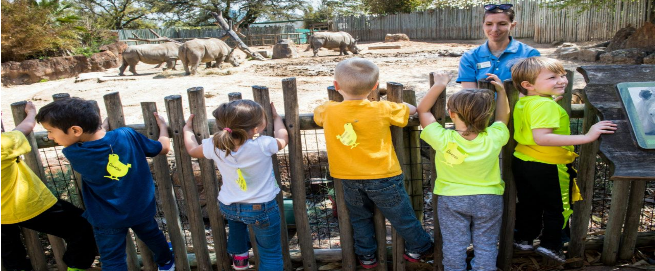
Figure 13. A class field trip to the zoo M

Inquiry Question: What questions do you have for the professional tour guide?