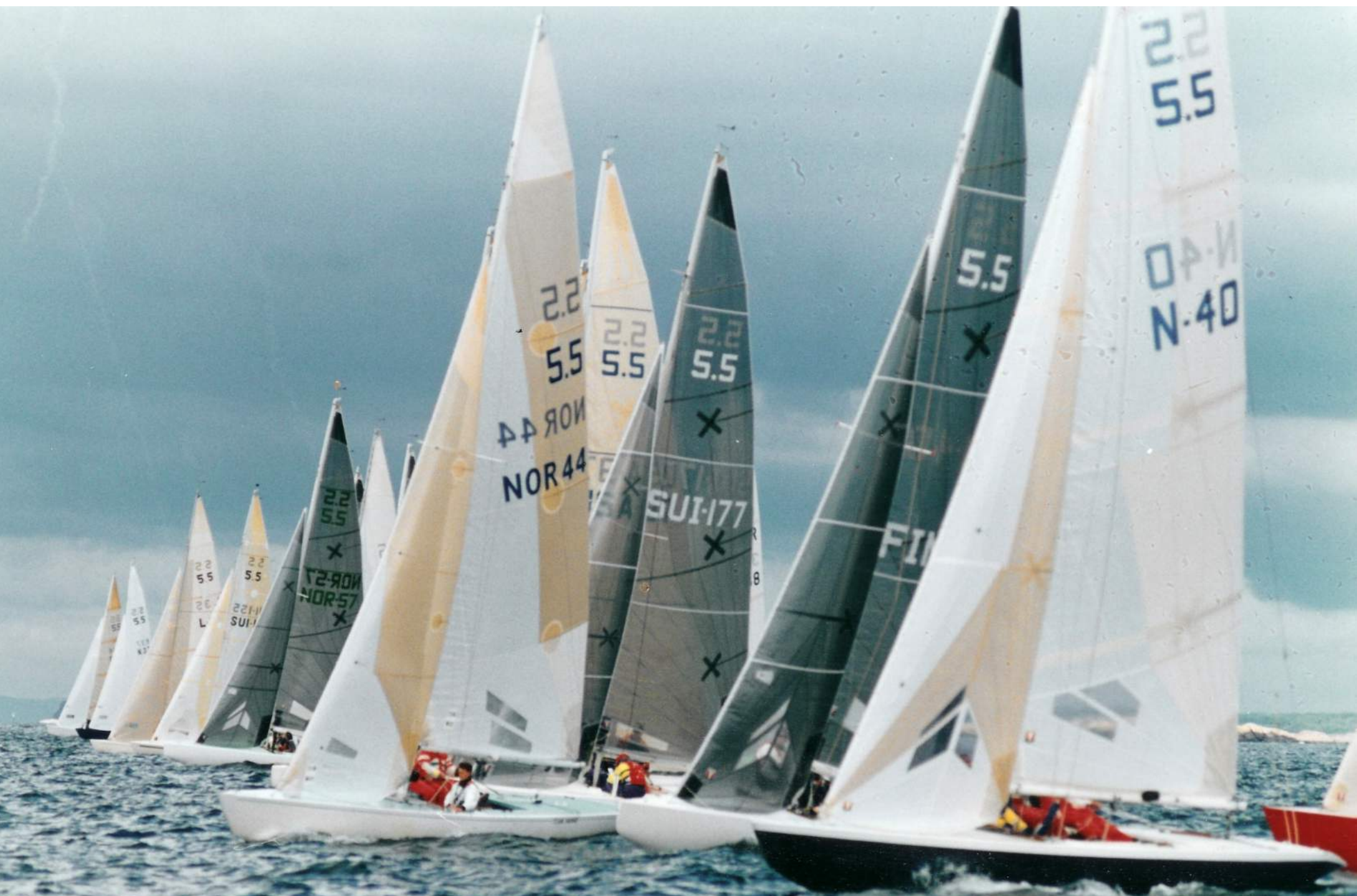
WORLDWIDE SAILING CHAMPIONSHIP 1993