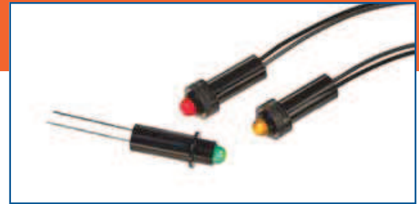
5mm Panel Mount LED Assemblies