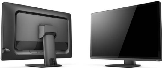
[ BLACK ]