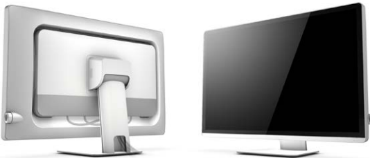
[ WHITE ]