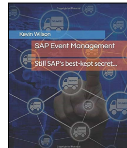
SAP Event Management – Still SAP's best-kept secret...