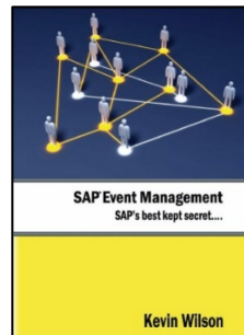
SAP Event Management – SAP's best kept secret...