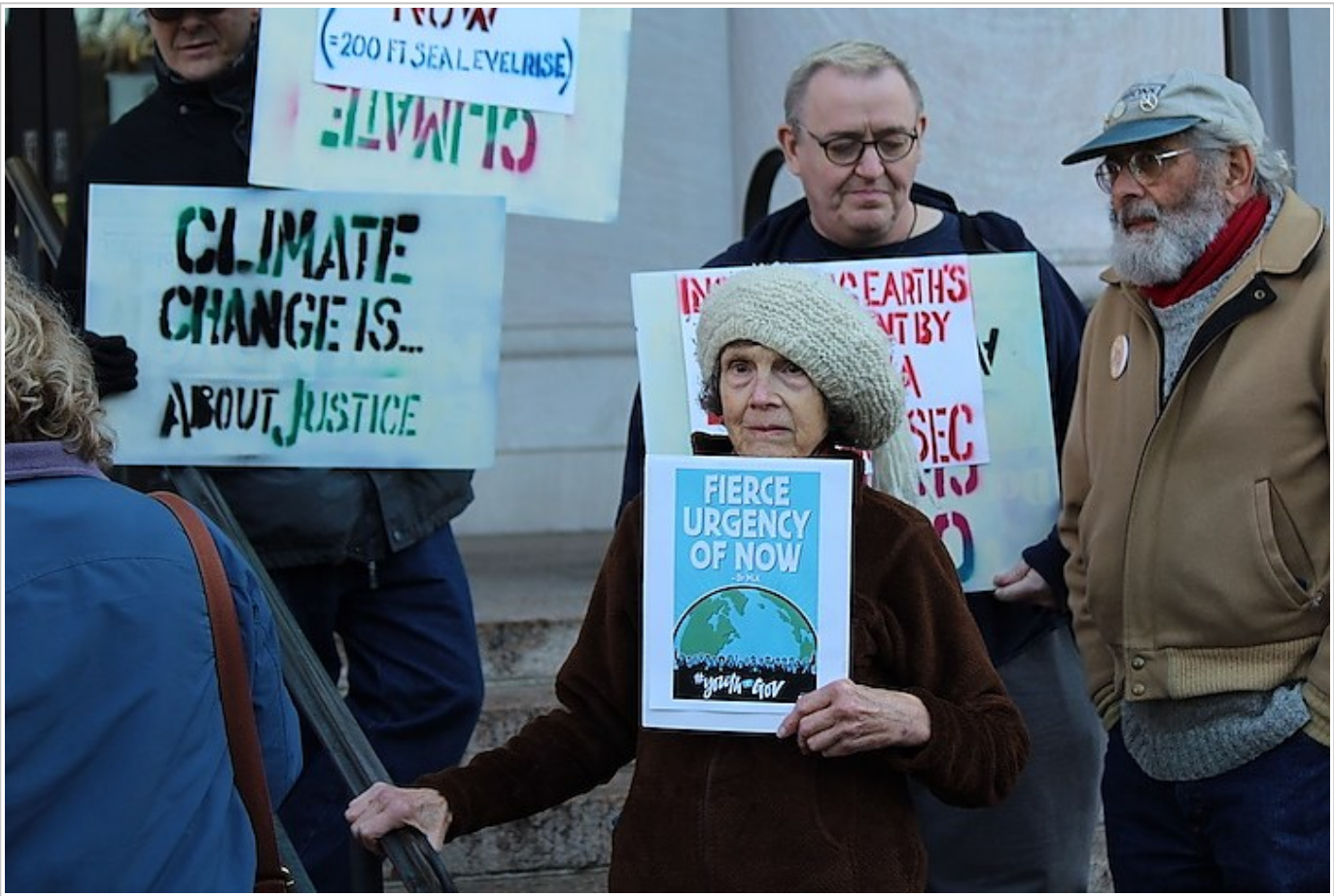
New Haven environmentalist showed their support.