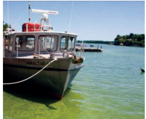
A cyanobacterial bloom in Lake Erie. It's impossible to tell visually, by taste or odor whether such a bloom is toxic (a HAB). Water samples must be analyzed for the presence of toxins.

State agencies collect water samples from many lakes and ponds to determine cyanobacterial toxin concentrations. The results are posted on state natural resource agency websites so that people can be aware of possible health threats to themselves and their dogs. In cases when toxin concentrations are unknown (ie. in those lakes that either unmonitored or in monitored lakes before test results are available), pet owners should err on the side of caution and keep their dogs out of the water when suspicious looking blooms appear—until more information is available. People are encouraged to report suspected HABs to local health departments or state natural resource agencies.