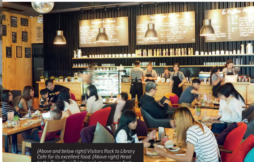
(Above and below right) Visitors flock to Library Cafe for its excellent food. (Above right) Head to the River Kwai Bridge early to cross on foot. (Below left) A local temple. (Bottom) Chungkai War Cemetery is a sobering experience.

“Kanchanaburi has a dark history that contrasts with a vibrant present”