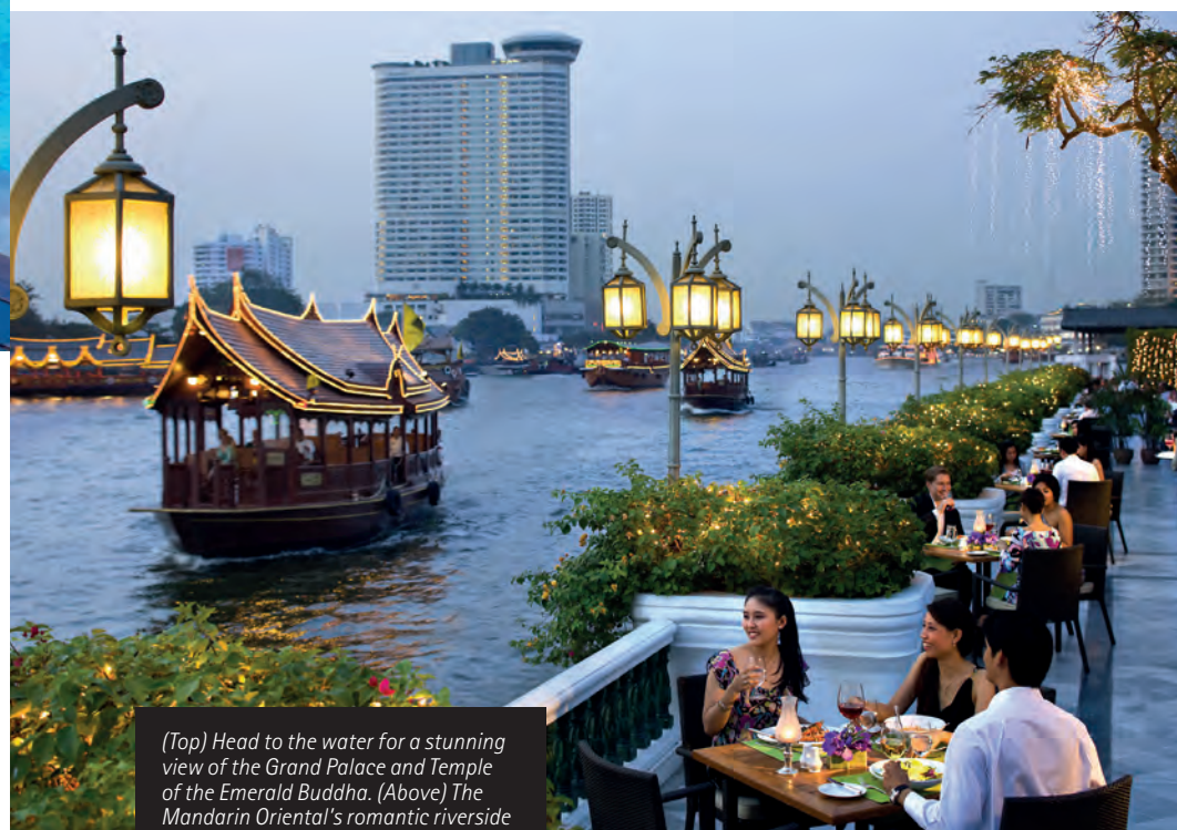
(Top) Head to the water for a stunning view of the Grand Palace and Temple of the Emerald Buddha. (Above) The Mandarin Oriental's romantic riverside restaurant showcases Bangkok's blend of old and new. (Below) You'll feel on top of the world at Moon Bar, one of the city's best rooftop cocktail bars.

STAY: Bangkok is such a large city, that it's best to first decide what you want to see and do before choosing a hotel that will best suit your itinerary. That said, for vintage glamour, stunning riverside views and magical memories, we recommend staying at the Mandarin Oriental , which first opened way back in 1876. →