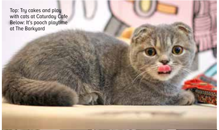
Top: Try cakes and play with cats at Caturday Cafe Below: It’s pooch playtime at The Barkyard

While there are meals to choose from, most guests seem to go for the cakes on offer – try the rainbow crepe (THB138/$$5.60), a kaleidoscope of colour draped in strawberry sauce.