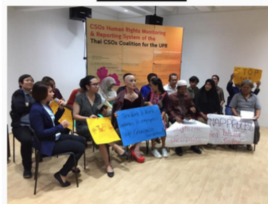
Activists 'Ignored in the drafting of rights plan

national August 24, 2018 01:00 By THE NATION 5,174 Views