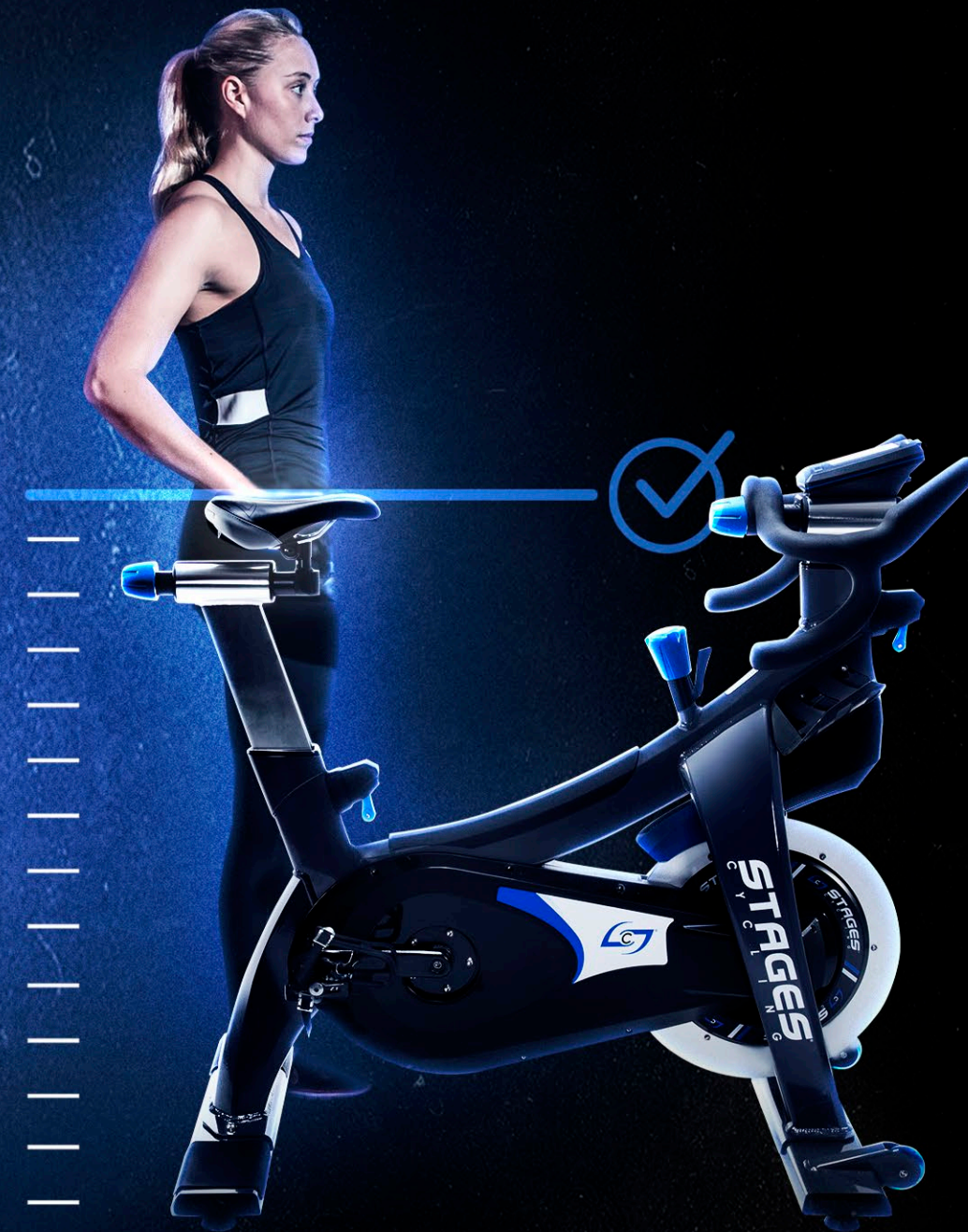
Amber Gamble, Stages Coach and Ambassador Take Centre Stage Programme.

We've applied road bike geometry to the SC bike frame to create a bike that allows your members to quickly and safely find their ideal ride positions. Our proprietary fore/aft and height adjustment mechanisms facilitate making those changes easily.